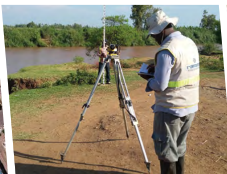
Land Survey Solutions