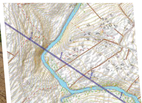
GIS & Mapping