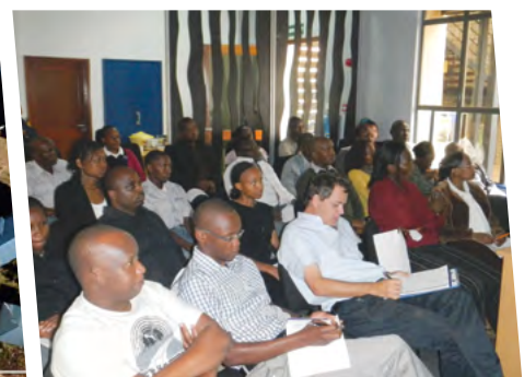
Consultancy & Training